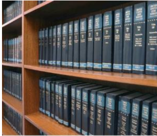
VETERINARY ALUMNI QUARTERLY, VOLUMES 1-3